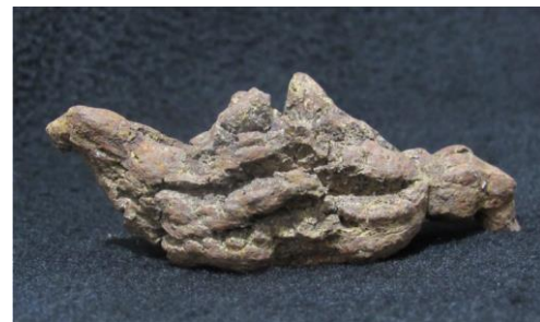
A coprolite is a trace fossil that can reveal details about what an animal ate and how completely the food was digested