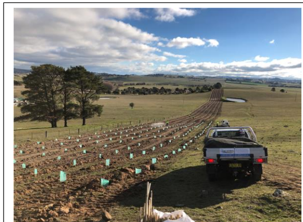
Biodiversity corridor planted at McPhillamys

4. Explain how the tree planting project addresses different aspects of sustainability. _____