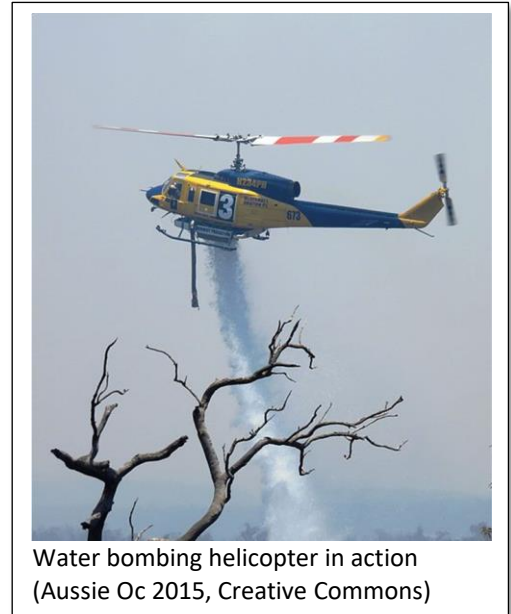
Water bombing helicopter in action

What do you think is the most important action to be taken to prevent further disasters like the 2019-2020 bushfires? Justify your answer.