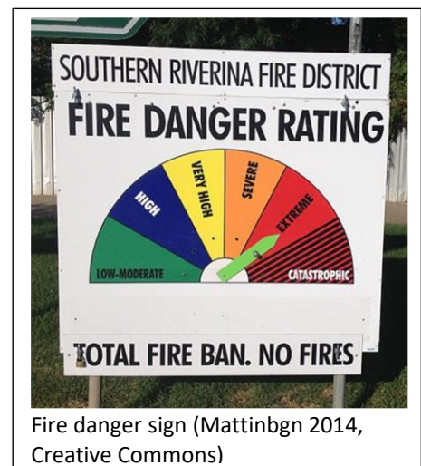
Fire danger sign