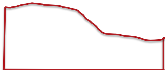
Cleared land with dryland salinity

Native trees and grasses allow a _____ amount of water to infiltrate to the water table, but annual pasture has a _____ leakage rate.