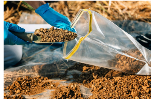
Figure 1: Collecting soil